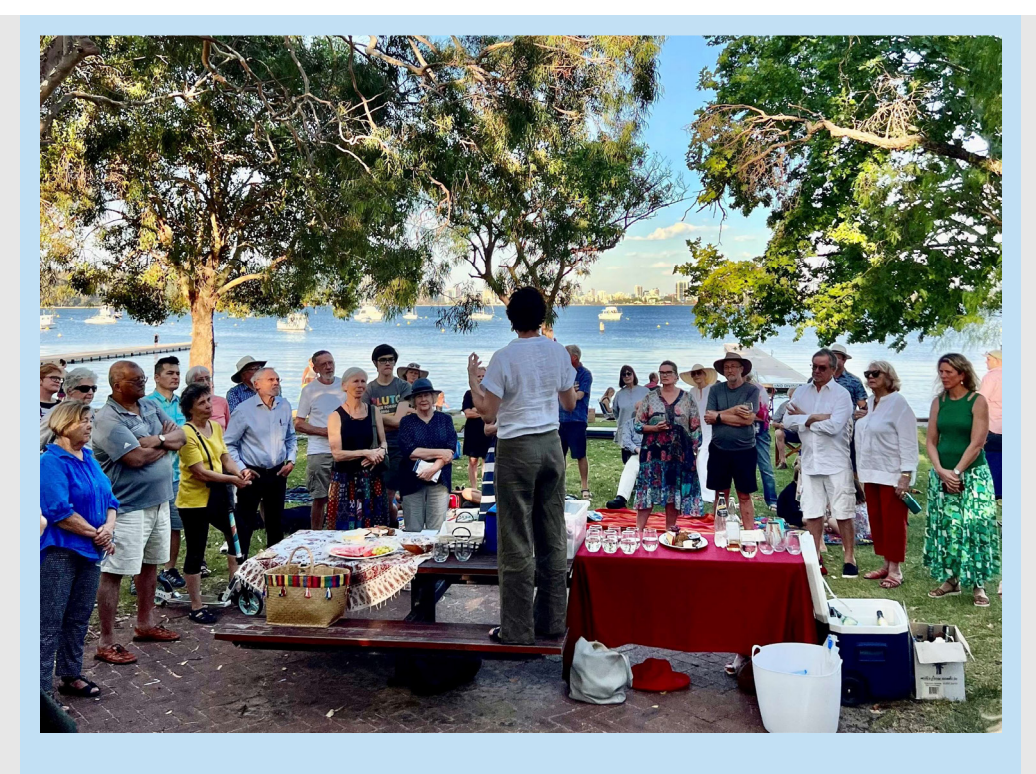
December Community Catch-Up at Matilda Bay