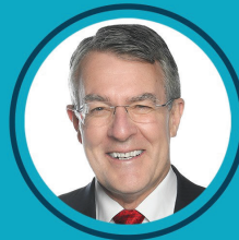
HON MARK DREYFUS KC MP